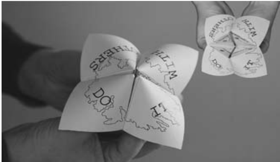
DIWO Furtherfield Neighbourhood Map

agency, through collaboration and negotiation, across physical and virtual networks—maintaining a critical consciousness and hopefully, somehow having a decent life at the same time... We are aware that we may have underplayed some of the difficulties that we continue to face in sustaining our activities. Another time. Instead, we wanted to share our understanding, drawn from our own experience, of the value of nurturing non-commercially-driven spaces for collaboratively authored and variegated visions that involve the use of technology. Because if we do not take control of the tools and the media, and at least make an effort to empower ourselves and the communities that we value, then others may come along and take that possibility from us.