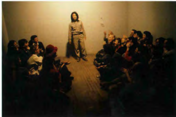
Tehching Hsieh, One Year Performance 1980-1981, New York "Final Punching With Audience"