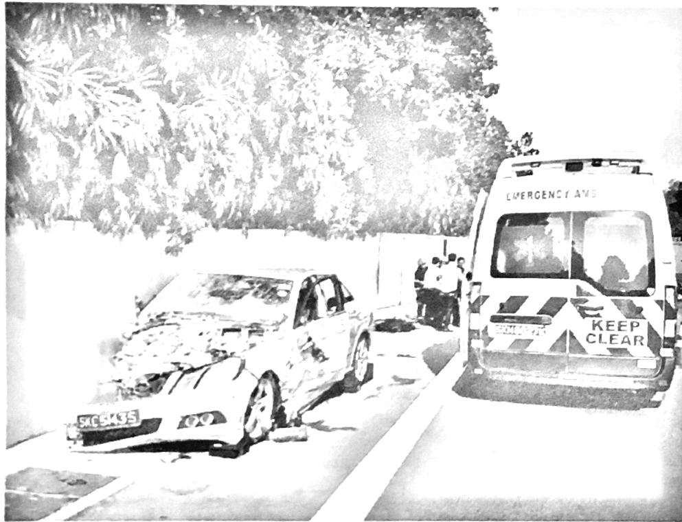
The extent of wreckage could be seen in full detail the next morning.