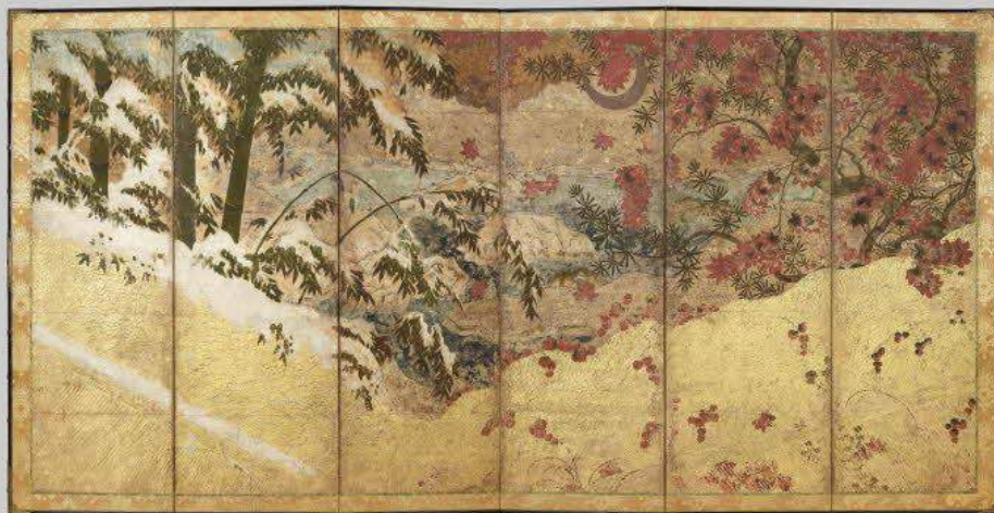
Four Seasons With Sun and Moon, Mid 16th century Ink, colours, gold and silver on paper Collection of The British Museum