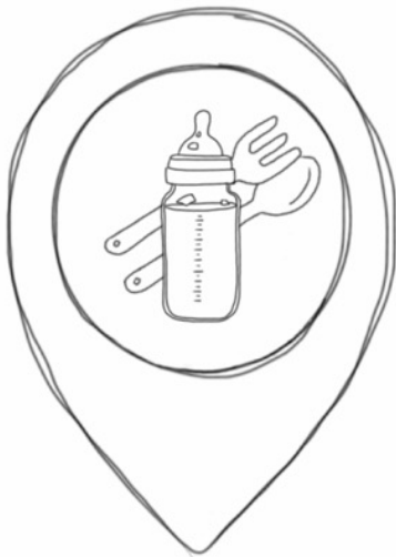
Icon: Restaurants with kid's meals

Because the zine is targetted at families with children, I researched on the food places and filtered out places that were more suitable for children to dine in, and excluded those that sold food that wasn't suitable for children. Furthermore, out of the chosen restaurants, I researched and further filtered the restaurants with kid's meals and made an icon for these restaurants, denoting beside these restaurants to better inform the families of the places they could possibly dine in.