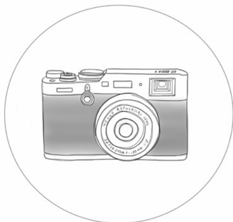
Icon: Photo spot that are ideal for family photos