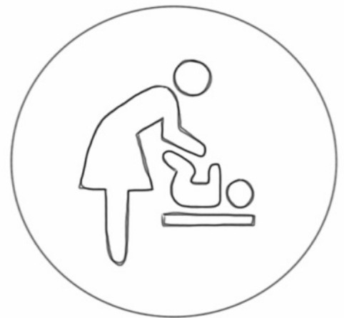
Icon: Changing rooms available within the attraction