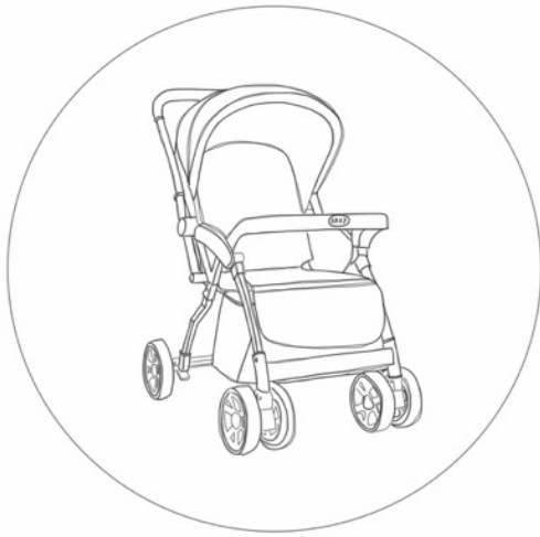
Icon: Places that have available space for families to park their strollers

As the zine is a families guide to the island, I included other icons such as: