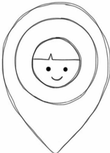
Icon: Places with activities suitable for children

Based on the survey results during the research period for this project, I filtered out the more popular places visitors would visit and decided to include them into the spread. To further indicate the suitability of these places, I created another icon to denote the places that had activities for children and placed these icons beside the places in the spread.