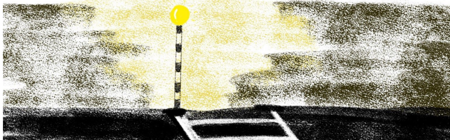
CLIPS OF LAMPS AT ZEBRA CROSSINGS