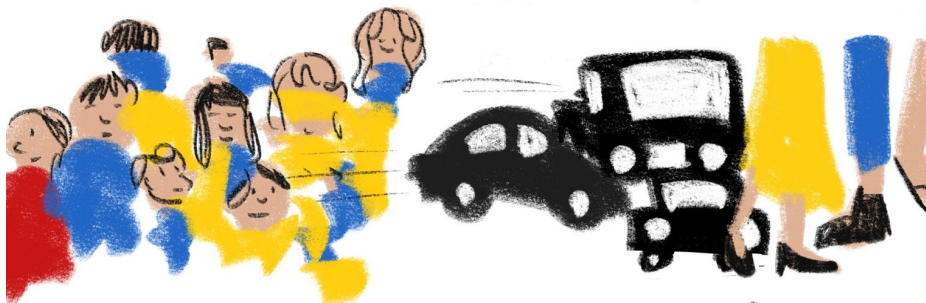
CUTS OF CLIPS - PEOPLE → CARS → FOOTSTEPS