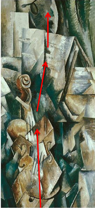
Figure 2: https://www.wikiart.org/en/georges-braque/violin-and-palette-1909