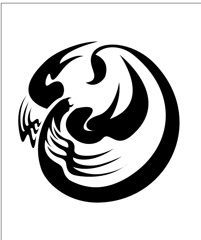
Final Black & White