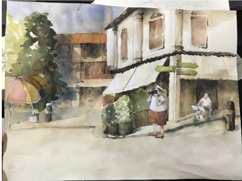
Theme 3: Landscape Format, Atmospheric Mood