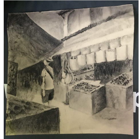
Theme 2: Space Design with Overlapping Patterns / Portrait or Landscape format