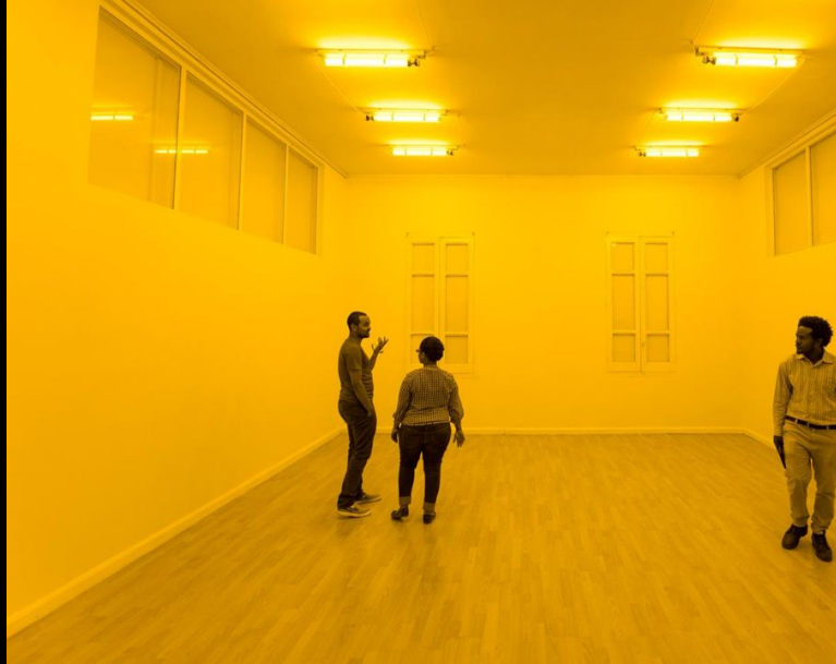
Yellow Corridor by Olafure Liasson