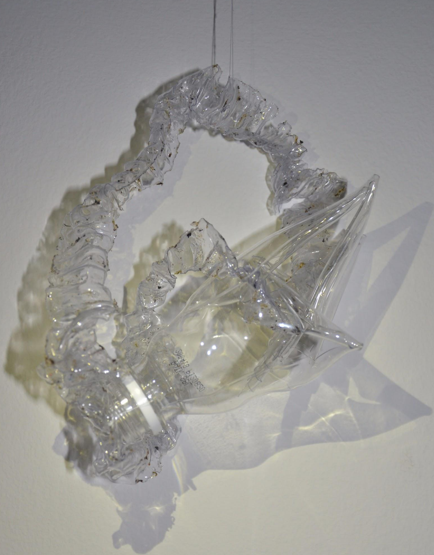
{Plastic Model} Mnemosyne's Scent