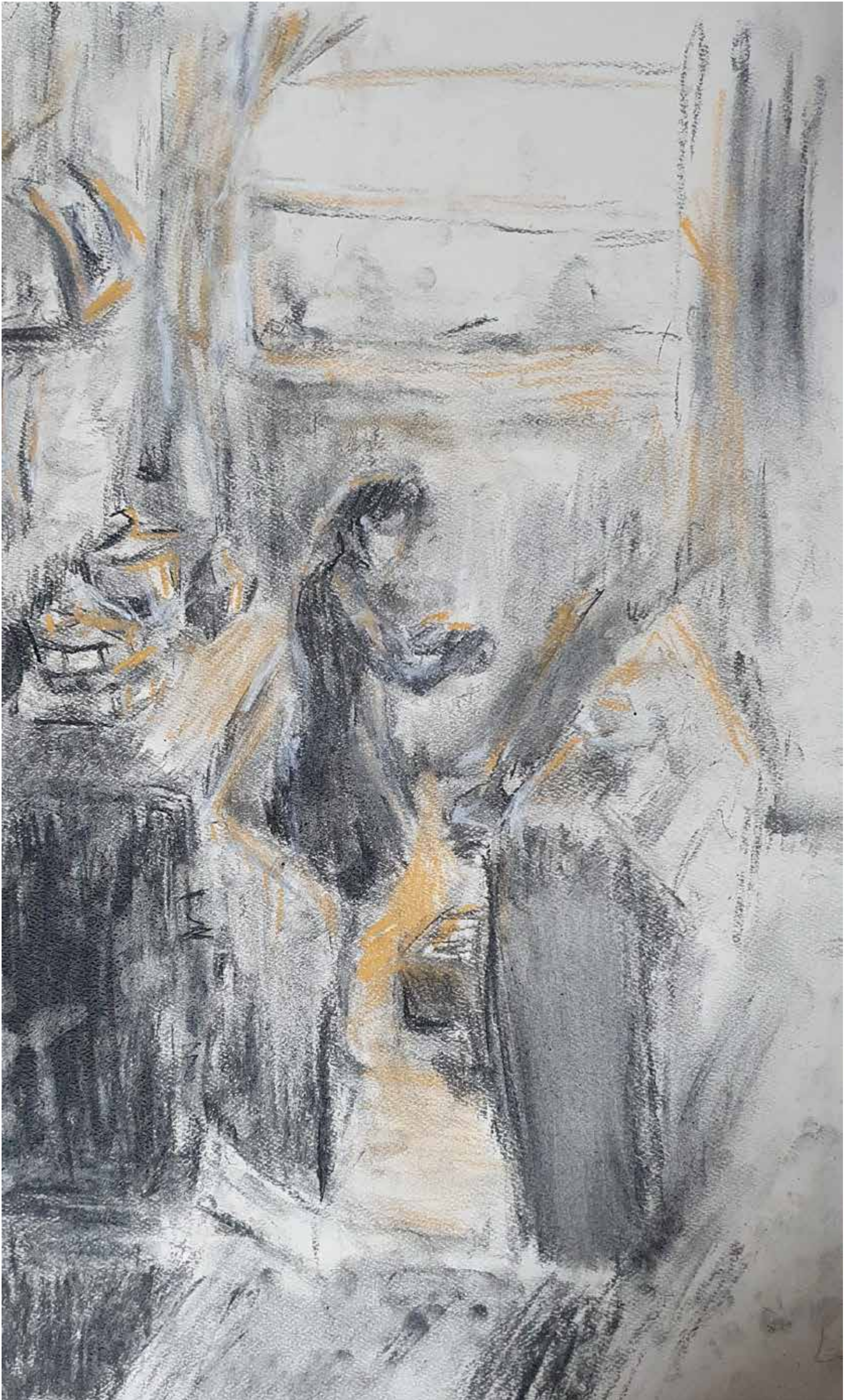
No. 04, Sunlight entering Charcoal and Conte