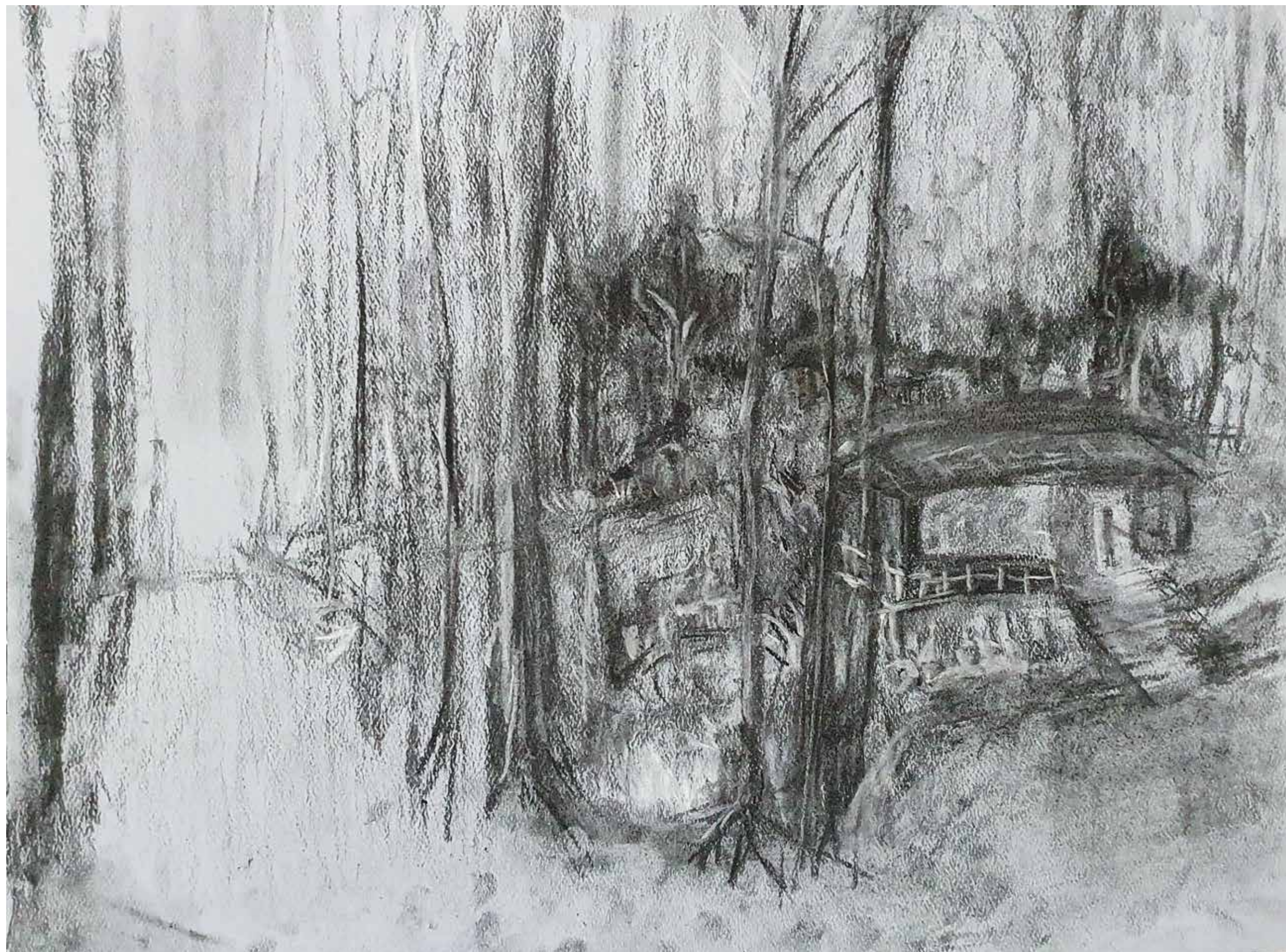
No. 03, Atmospheric Mood Charcoal and Conte